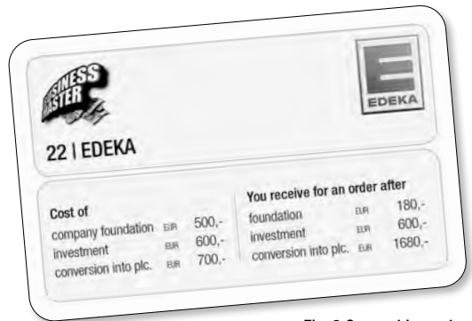
Fig. 3 Ownership card

Each time a player passes the start field the bank pays him a grant of 400 euros. If he lands directly on the start field he receives a grant of 800 euros.