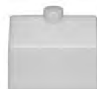
PLC symbol (yellow)